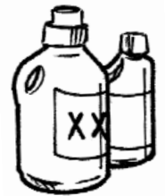
Bleach and Cleaners